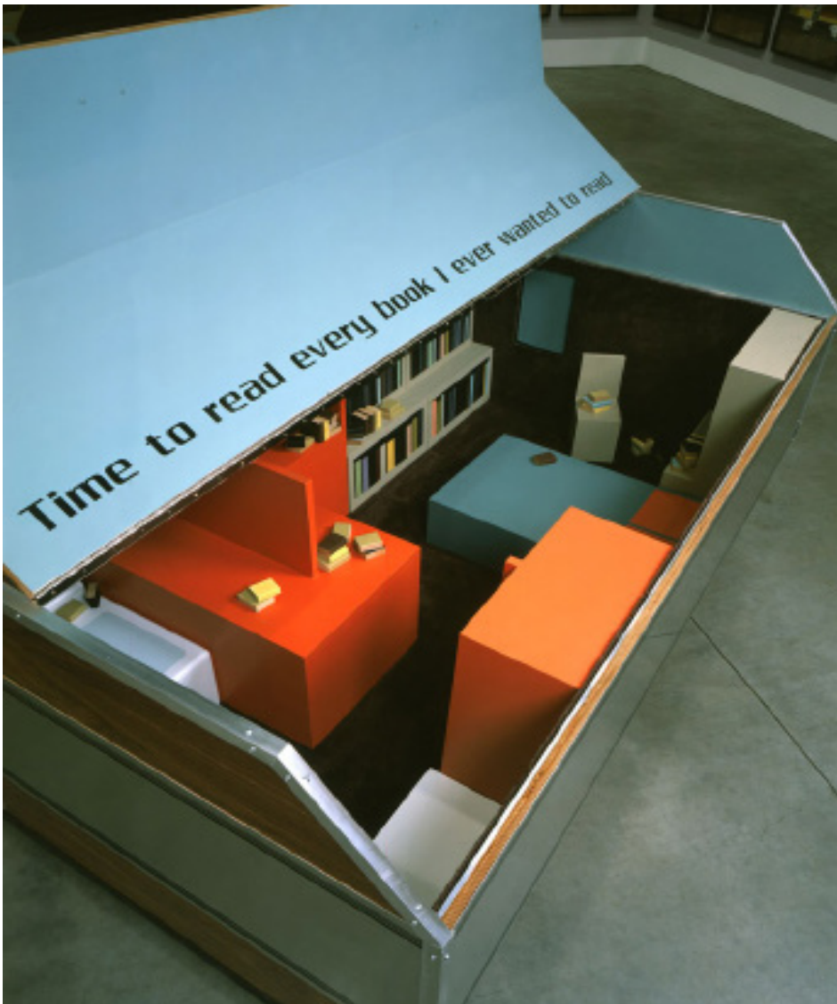
Andrea Zittel, A-Z Time Tunnel: Time To Read Every Book I Ever Wanted To Read , 2000, Walnut wood, steel, carpet, paint, vinyl adhesive, MOF, electrical lighting, sound machine, 39 x 48 1/4 x 80 1/2 11 (closed without ladder), 46 3/4 x 38 1/4 x 94 1/4" (open with ladder).

my dad got hit in the head with the main boom, he was bleeding everywhere and it took us a whole day to get to land. Another time a whale kept diving back and forth under our boat and we all thought it was going to knock us over. All I wanted was to feel safe and secure when I grew up, because I never felt like that when I was a kid. Everything was so precarious, all the time. But I guess the thrill-seeking gene is still there, and since I now know how these experiences can shift my consciousness it has become sort of addictive. The Time Trials was an attempt to shift perception through the smallest, most minute change: by not doing anything different and