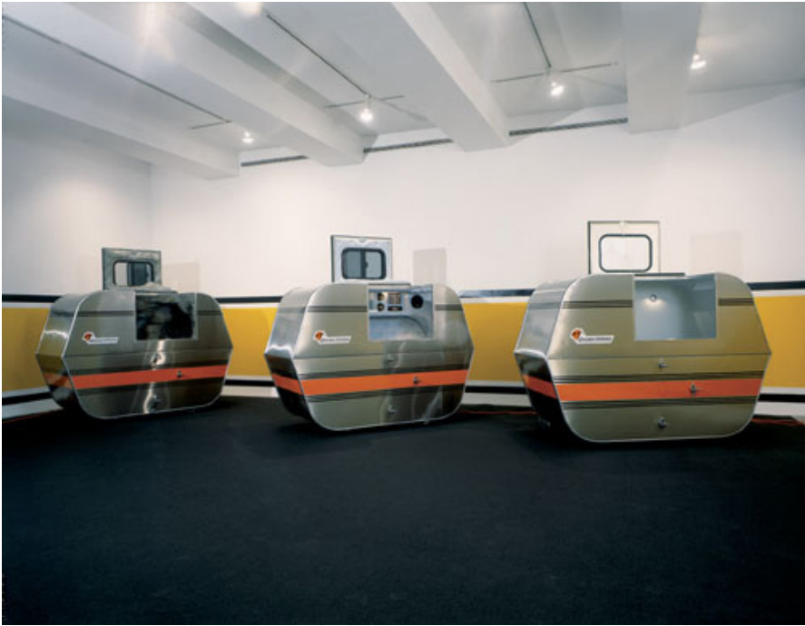
Andrea Zittel, "A-Z Escape Vehicles," 1996.